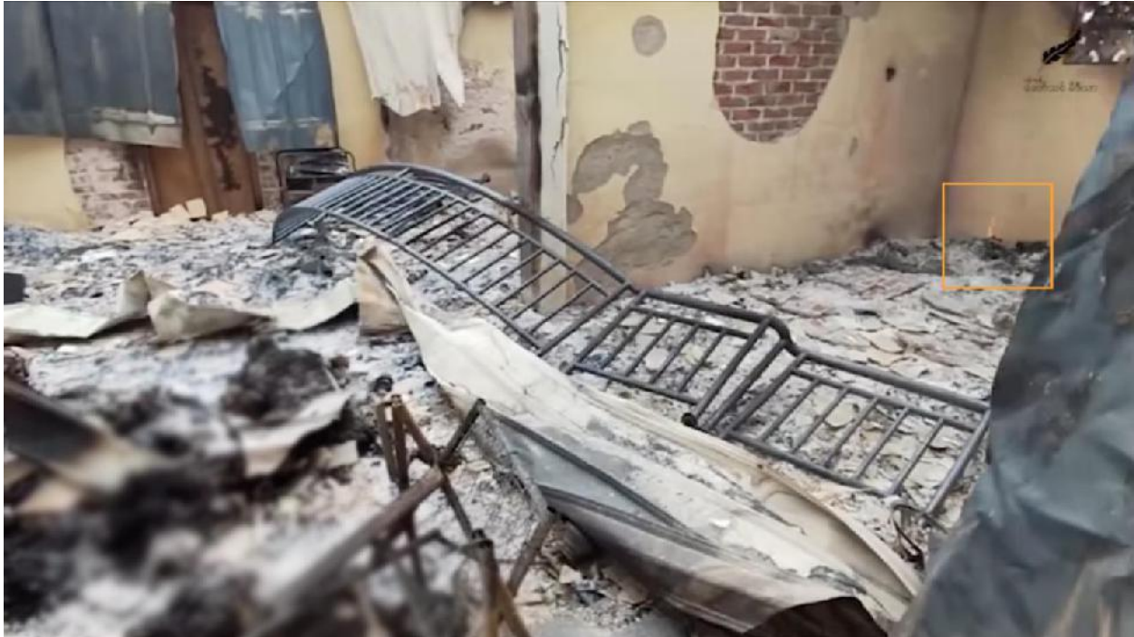
Figure 9: There are burnt marks on the wall in the corner right of the camera. A small flame is still visible in the same corner (orange).