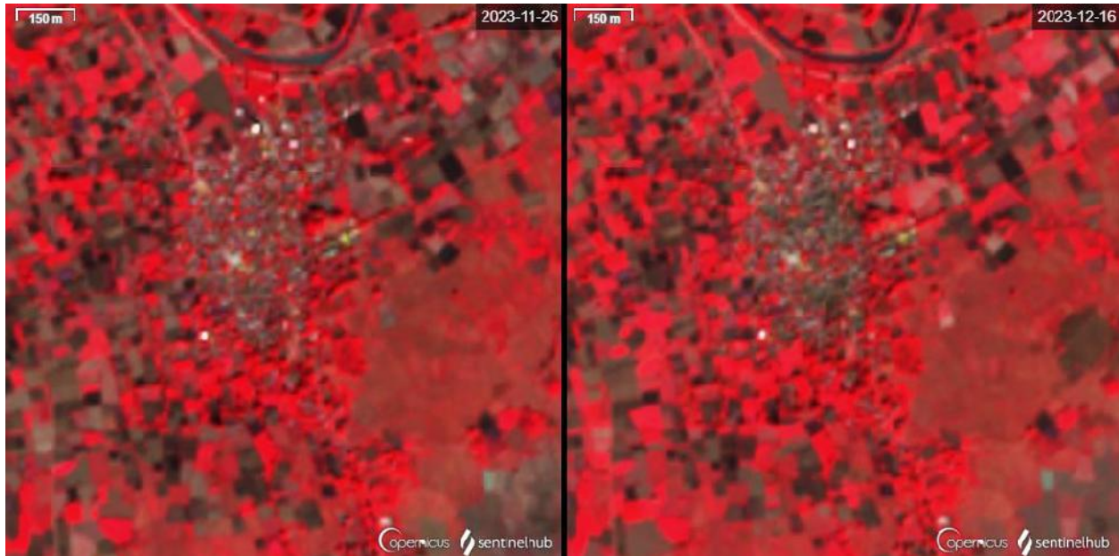
Figure 5: Sentinel-2 false colour filters show significant changes (grey), suggesting fire damage, in Kya Paing village, between 26 November and 16 December 2023.