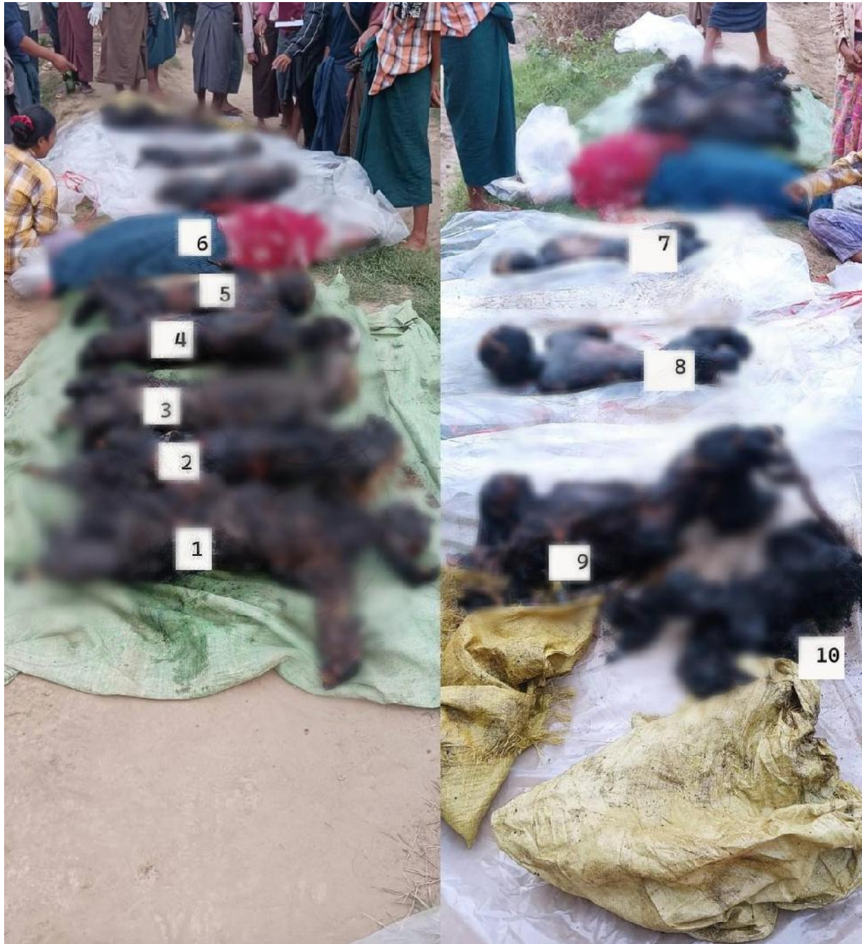
Figure 7: There appear to be eight or nine burnt bodies (it is unclear if bodies labelled nine and ten are separate victims or the same body) and one unburnt body (source redacted due to privacy concerns).

In the photos posted on Facebook, there appear to be eight or nine burnt bodies and one unburnt body lined up together on blankets and plastic wrapping (figure 7). The post claims that there were ten dead bodies overall, however, the extent of the damage to the bodies means that Myanmar Witness cannot confidently confirm this.