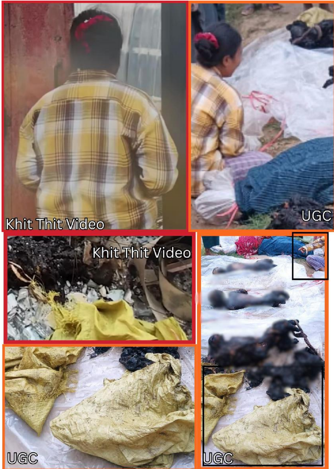
Figure 6: A lady can be seen wearing the same shirt and hair tie at the beginning of the Khit Thit Media video and in one of the images with the burned bodies. Furthermore, a yellow tarp-like material is also visible in both the video and images of the charred bodies (sources: Khit Thit Media video and other sources are redacted due to privacy concerns).