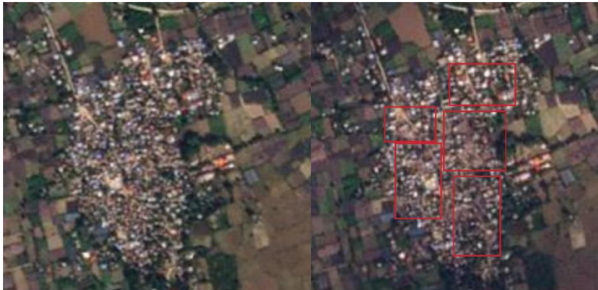
Figure 4: Planet imagery shows significant changes (red), especially in the middle and southern parts of Kya Paing village, between 27 November and 3 December 2023.