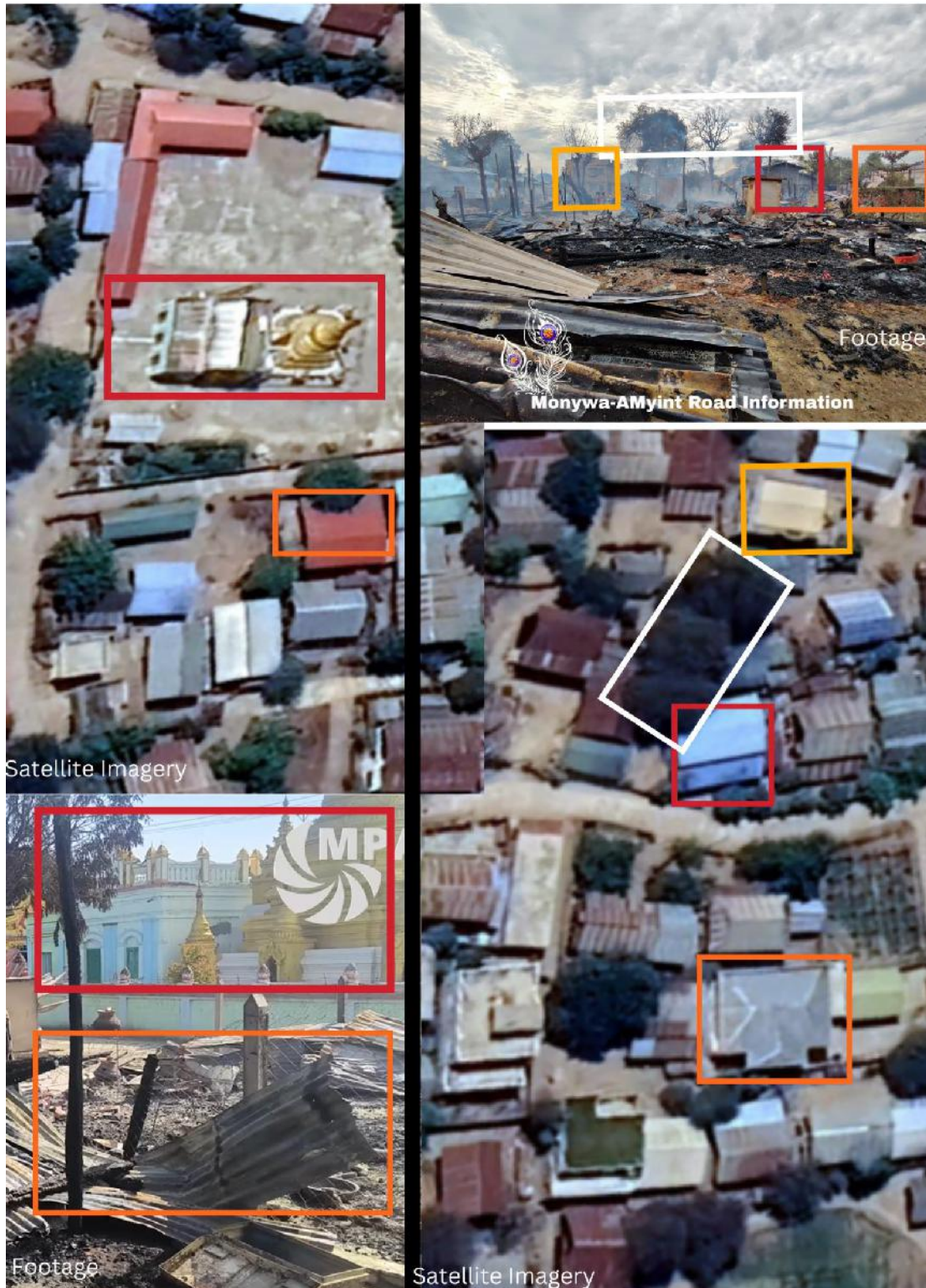
Figure 2: A number of houses were destroyed by fire at 22.035149, 95.202132 and 22.036619, 95.203096 in Kya Paing village.