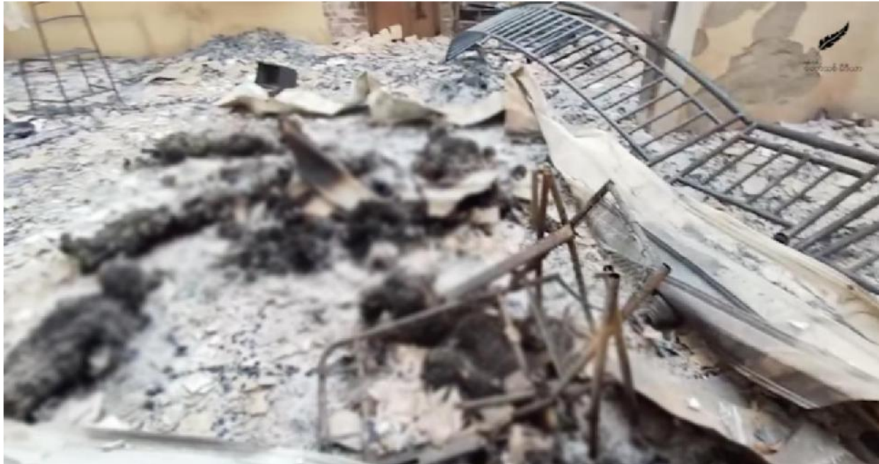
Figure 8: Clearly burned debris and ash covering the bodies are clearly visible in video footage.