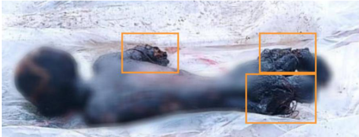
Figure 10: The image shows what appears to be three pieces of metal strings wrapped around the burnt body near the right arm and both thighs.