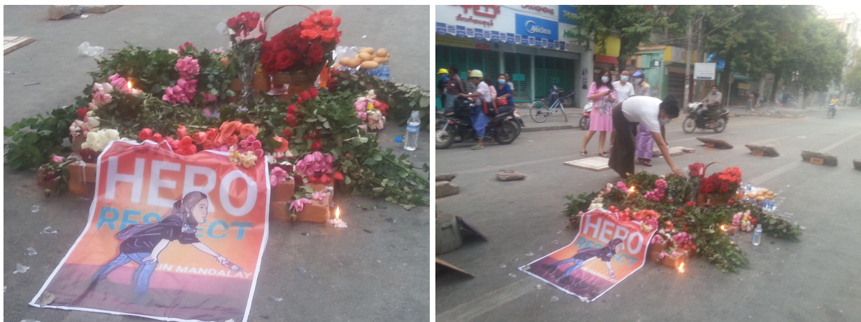
Figure 7: Memorial site in the street, believed to be at or near the location where Angel was shot.

Later, images appeared of a memorial site in the middle of the street, not far from where the protests happened. This might indicate that she died or was shot here, between the barricade and the images of Angel wounded on the back of a motorbike.