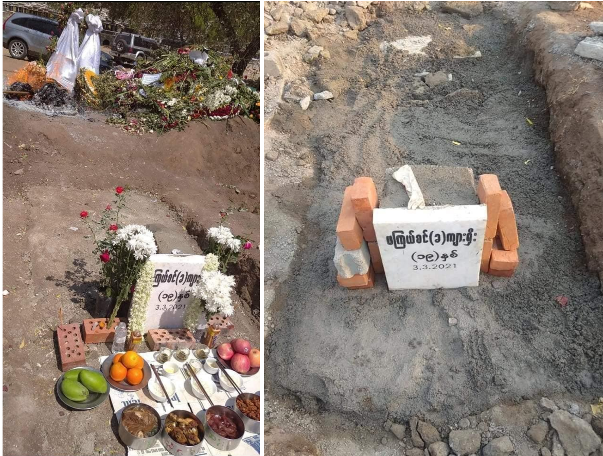
Figure 15: Angel's grave, along with her death date and name.