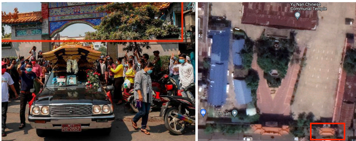
Figure 9: Geolocation of the car departing the memorial service with Angel's body.