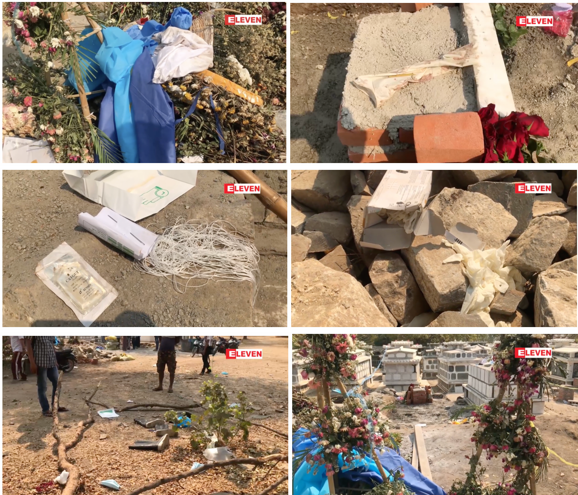
Figure 11: Evidence left after her grave was tampered with, including surgical equipment and gloves.