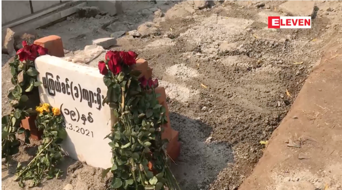
Figure 10: Angel's grave seen covered with cement after being tampered with in the night.

to conduct an autopsy and determine Angel's cause of death. They claim they had gained permission from a judge, but the specifics were not volunteered. According to CNN an eyewitness saw around twenty people with guns enter the graveyard between 1600 and 1900, implying suspicious circumstances and explicitly stating that a military vehicle was present. The person at the gate who let them in was allegedly 'not [to] inform anyone about it' according to CNN's coverage.