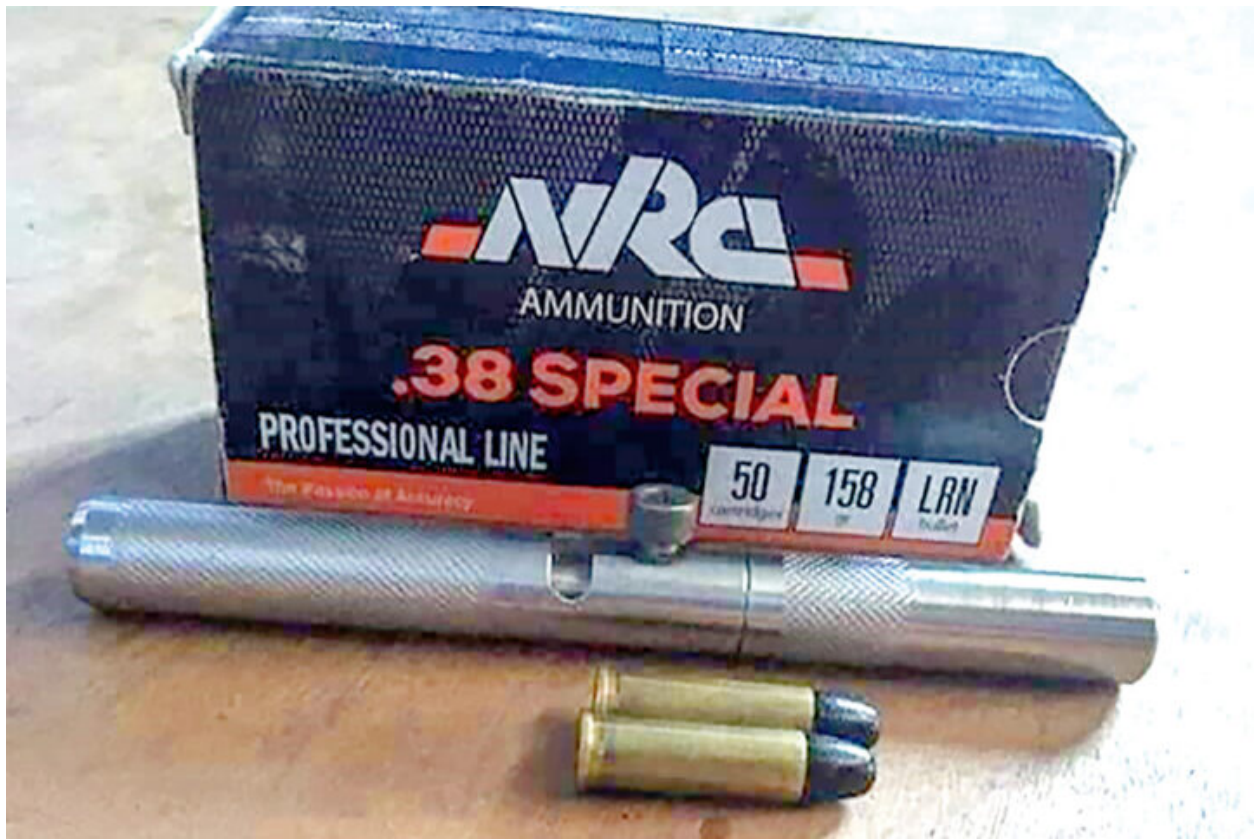
Figure 13: Image used in an article by the pro-government outlet GNLM showcasing the type of bullet they determined had killed Angel.

GNLM also said that although “the security guards on duty at the time of incident were in a face-to-face position to the crowd, the injury was in the back of the deceased”. This is true, however video footage geolocated by Myanmar Witness, believed to show the moment Angel was hit, demonstrates her running away from the police line as gunshots can be heard. She is seen falling to the ground, away from the police, with the back of her head facing them at around 21.977227, 96.077500. Myanmar Witness cannot confirm that Angel was shot in this footage, as this fall could also be from tripping over the bricks present in the footage.