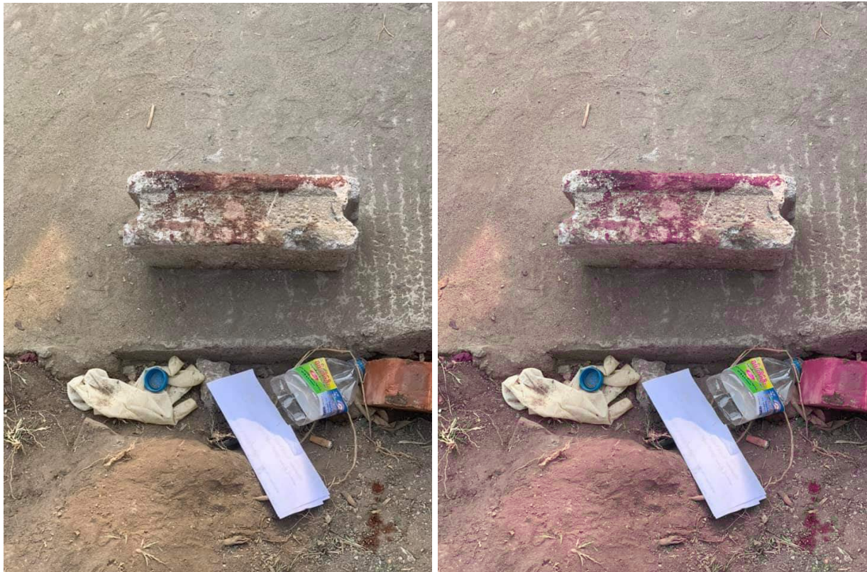
Figure 12: (Left) the original photo; (right) Magenta-optimised photo to highlight blood stains. Brick found next to Angel's grave with bloodstains on it and on the ground. The blood stain pattern is strongest on the long edge and may have been from impact. This suggests that the brick may have been used to crack open her skull. Also note the surgical gloves.

The military announced on Myanmar Radio and Television (MRTV) and Myawaddy News (MWD) that neither they, nor the state police, were responsible for Angel's death. The police also released a statement through GNLM that they had determined that the bullet had not come from a police bullet, saying: "The lead piece found in the head was a type of ammunition that can be fired with a shotgun with 0.38 round of ammunition...", (Figure 13) adding that this ammunition is "different from the riot control bullets used by the Myanmar Police Force". The possibility of Angel's body having been tampered with, potentially using a brick on her head, also coincides with this state narrative focus on bullets used in the shooting, as they would be targeting her head where it might be possible to retrieve a bullet and dismiss the state narrative determining no security force accountability in Angel's death.